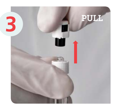
Handling of the V-OVS closure system

Please see Important Safety Information on the back cover, and enclosed full prescribing information and boxed warning for ITP indication in pocket.