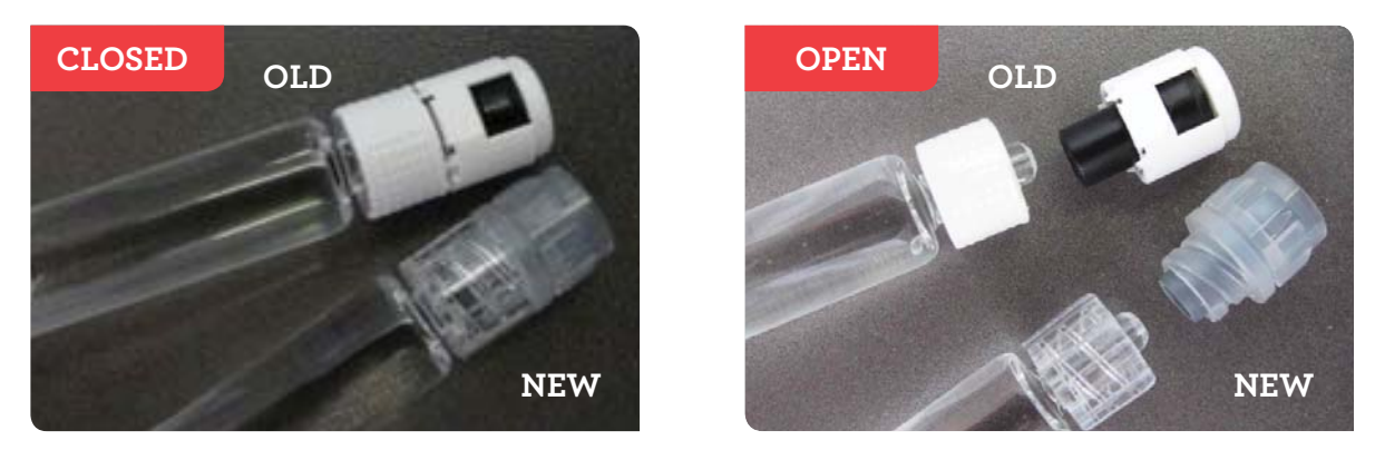
V-OVS (white closure system) and the PRTC (transparent/gray closure system) shown in closed and opened positions.

Up to September 2013, Rhophylac syringes were supplied with a white closure system known as V-OVS tamper-evident closure. Since September 2013, a different closure system has been implemented for Rhophylac syringes. An element of the BD Hypak<sup>™</sup> PRTC system, this closure features a plastic rigid tip cap with a Luer-Lok<sup>™</sup> adaptor.